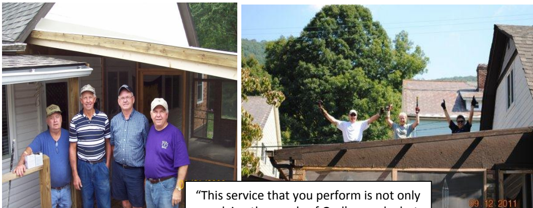
"This service that you perform is not only supplying the needs of God's people, but is also overflowing in many expressions of thanks to God." 2nd Corinthians 9:12

As we arrived at the shop a lady came out to help us pick out the color for the aluminum roof...and I mentioned we would like to pick up the order today. She said, oh it may be a few days there are orders ahead of you. So we walked around the corner to the back building ... some were concerned...and some of us with praise because Father knew our need. We greeted a sweet humble man that was the business owner and gave him our color and order. Again, I mentioned that we would like it today. In his humble way "that won't take about 5 minutes we have that color loaded so we will get it right out". We thanked him and looked at each other...and praised the Lord.